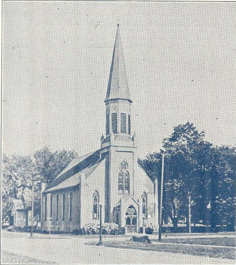
Above is shown the Concordia Lutheran church building before it was remodeled in 1937. The present remodeled church is pictured on the outside front cover of this booklet.